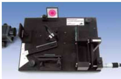
Glass plate in the beam path of the Michelson-interferometer.