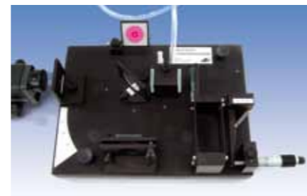
Vacuum chamber in the beam path of the Michelson-interferometer.